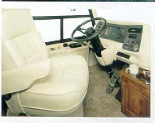
Adjust the driver's seat (power optional) to your favorite position. The conveniently located controls fall right at hand, and the rear vision camera is positioned so you won't have to look down to the dash.