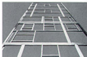
Our roofs have more steel cross members than most competitors with 24" to 30" centers compared to 36" to 48" for others.