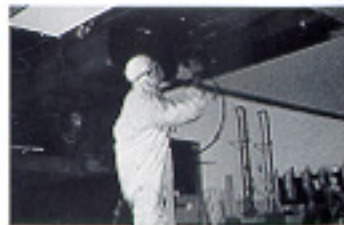
Extensive undercoating is applied to each unit to provide properly sealed compartments and to enhance sound deadening.