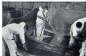
State-of-the-art fiberglass manufacturing holds to tight tolerances and achieves the highest levels of quality.