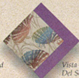
Vista Del Sol