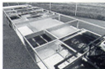
Chassis construction incorporates a heavy gauge galvanized sub floor installed directly on the frame. Wood is never used!