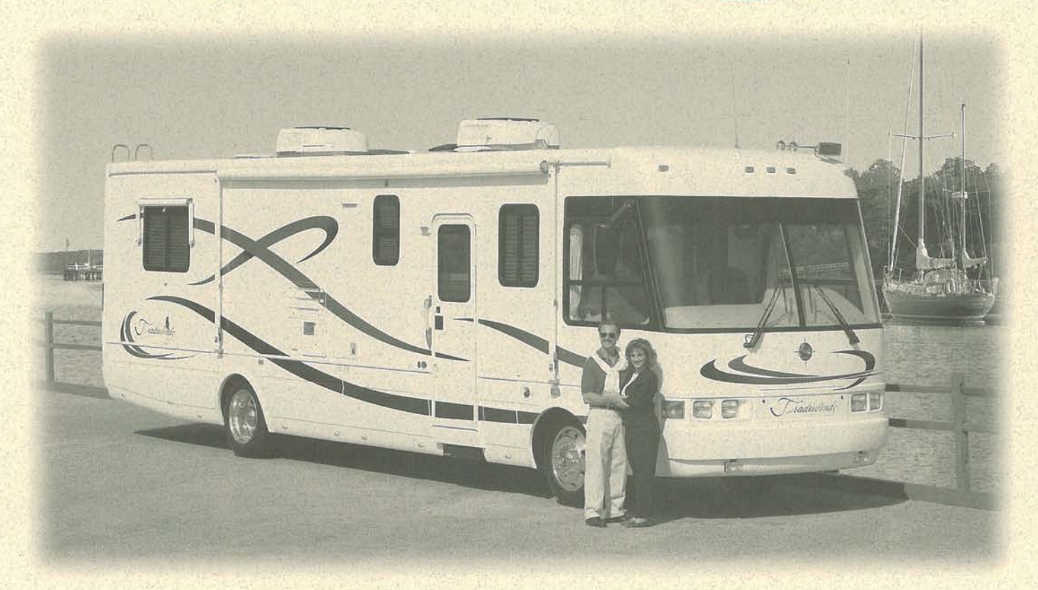
Specifications & Floor Plans